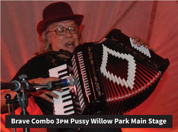
Brave Combo 3PM Pussy Willow Park Main Stage

Save The Date July 17, 18 & 19, 2020 42ND Annual Cheektowaga Polish American Arts Festival Cheektowaga Town Park Family Friendly 3 Days of Authentic Polish Music Polish Food & Fun Vendors Demonstrations Parade Harlem Rd Cheektowaga