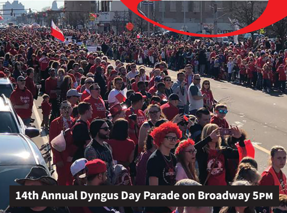
14th Annual Dyngus Day Parade on Broadway 5PM