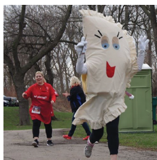
2nd Annual Dyngus Day Dash 10am

Corpus Christi Church Pre-Parade Party Family Friendly Official Easter Monday Catholic Mass Holy Mass 11:30AM Free Pre-Parade Party NOON-5PM