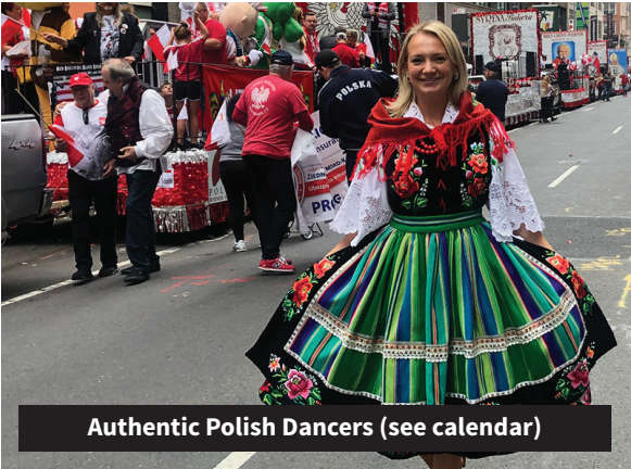
Authentic Polish Dancers (see calendar)